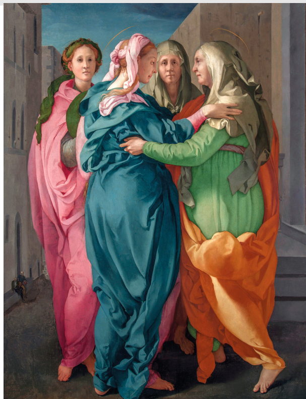
Visitation of Mary Jacopo da Pontormo, 1494–1556

Today's scripture lessons focus on the anticipation and surprise of the Advent season. The reading from Micah reveals that the small town of Bethlehem will be the birthplace of a faithful and righteous ruler. The lesson from Hebrews tells of the coming of this ruler, Jesus, the one who comes to fulfill the will of God and sanctify all who believe by his own sacrifice. Luke tells the story of Mary and Elizabeth, each of whom comes to know the surprising ways of God. Elizabeth, long barren, conceives John the Baptist, as foretold by the angel Gabriel. Mary visits Elizabeth after her own encounter with Gabriel and the news of her own unexpected pregnancy, and the women rejoice and marvel at the mysterious work of God.